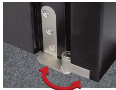
The special shape of the hinge allows a 180° opening