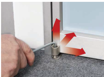
The eccentric pin allows the adjustment on 3 dimensions when door is installed.