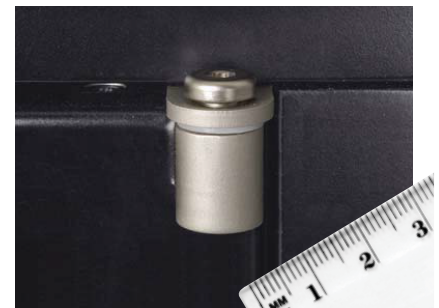
The rotating body of the hinge has minimum dimensions in order to reduce the visibility when door is closed